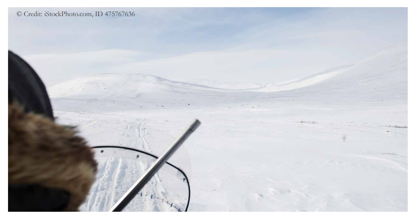
<sup>9</sup> Palluq (2007) as quoted in Dowsley et al. (2010, p. 156).

"The sea ice has really changed. I used to travel both by dog team and skidoo to and from Pond Inlet. In my recent trip, the snow has changed. The snow on top and snow condition on top has changed. Normally, in the spring, the snow on the top will freeze at night. This process is called qiqqsuqqaqtuq. This frozen layer can be seen when the day just starts getting daylight; it is sparkling because of the recent freeze up on top. I noticed it wasn't like that anymore. This process, the freezing, isn't happening anymore." 9